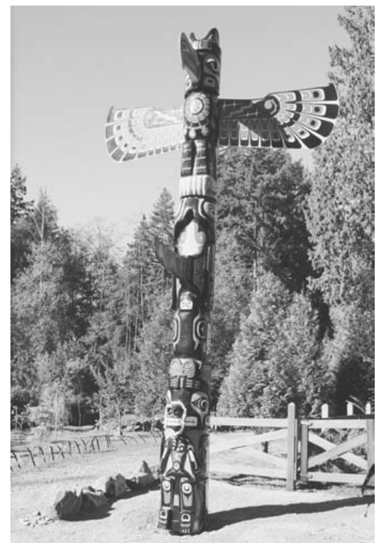
The pole at the Institute for Community Leadership in Kent, Washington-

Regular museum admission applies to this project. Call 360.432.3851 for questions or directions.