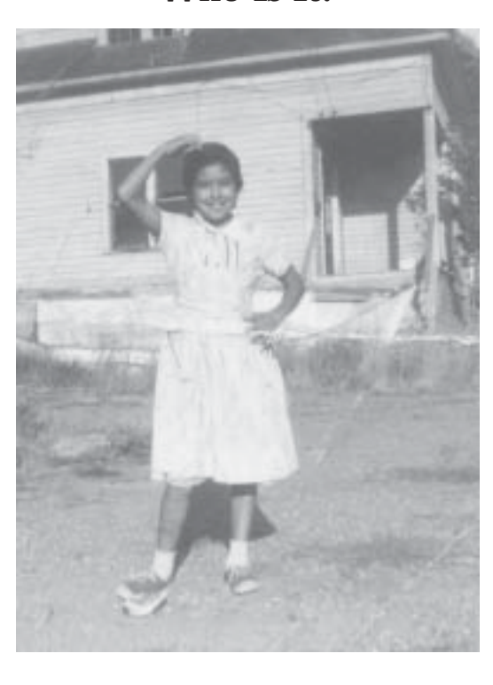
For the Answer, See Page 9