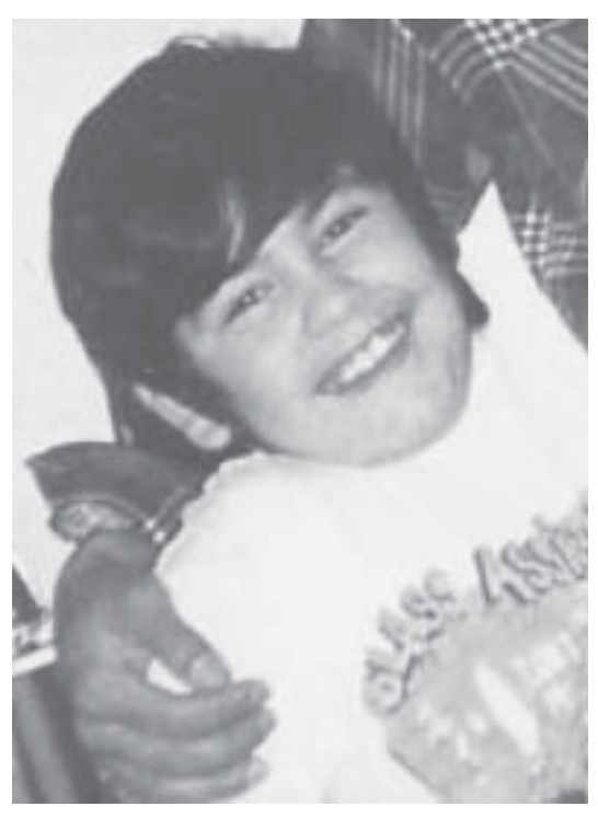
Love Ya Honey Love, Mom