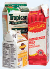
milk and juice cartons

PREPARATION clean • dry • quick rinse for milk and juice cartons