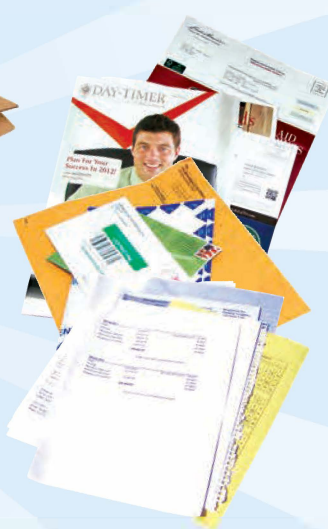
mail, magazines, mixed paper and catalogs