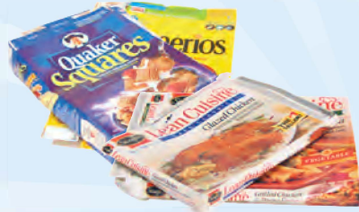
paper or frozen food boxes