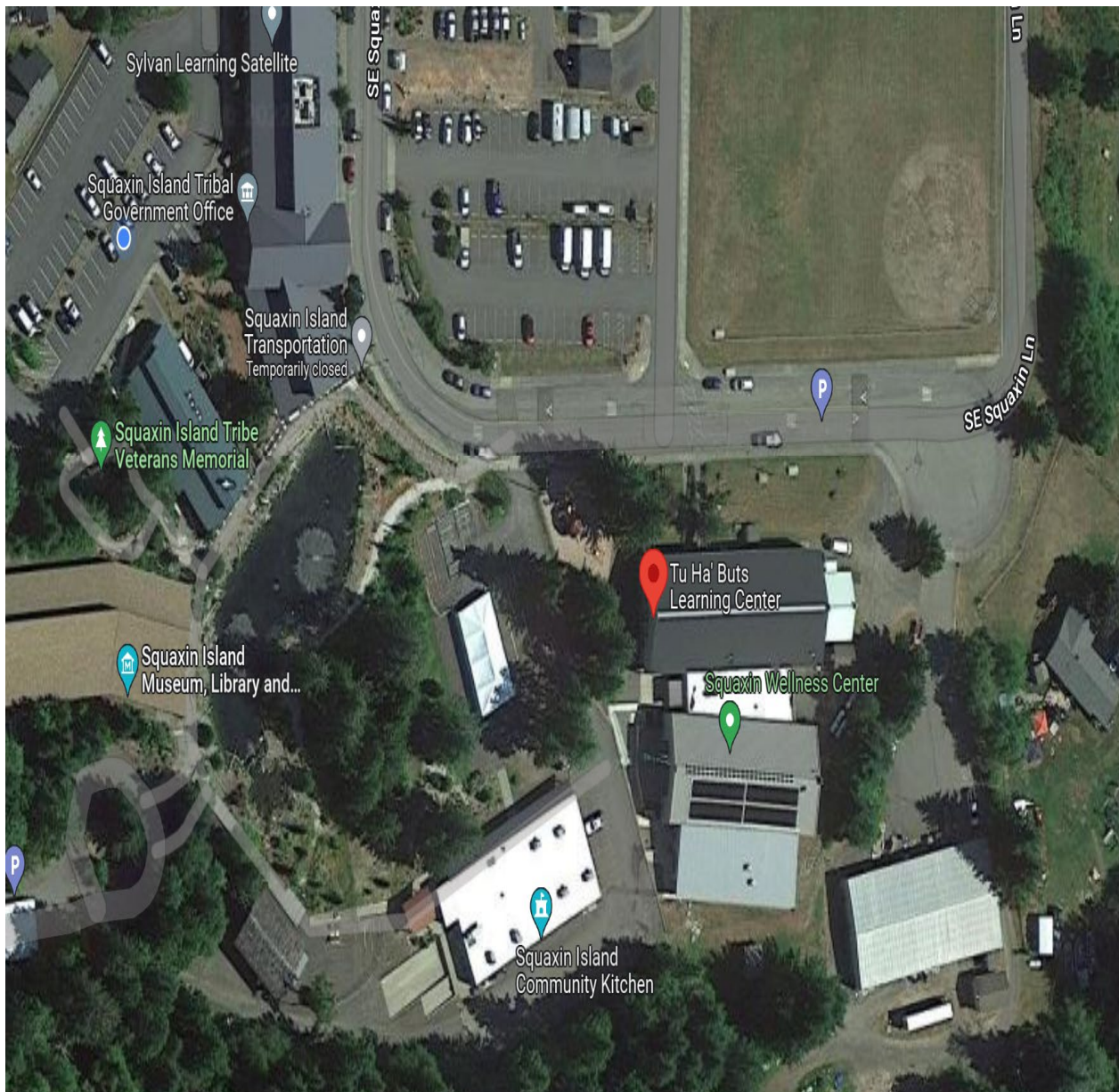
Figure 1: TLC (Tu' Ha Huts Learning Center) Improvement Project Location - 70 SE Squaxin Lane, Shelton, WA 98584 Low and