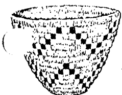
CONFEDERATED TRIBES OF THE CHEHALIS RESERVATION P.O. BOX 536 OAKVILLE, WA 98568 (206) 273-5911 753-3213

The packet on the LIHEAP Program includes the program deliverables and a sample tribal council resolution. The total grant award for FY-1993 is $67,000. This grant is used to assist tribal members of the Chehalis, Nisqually, Skokomish, and Squaxin Island Tribes with energy bills. A small percentage is used for SPIPA to administer the program. Again, please have the typist update the dates on the resolution.